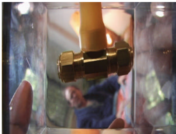
Distorted by desire.